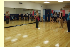
Dance Studio A