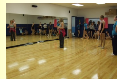
Dance Studio A