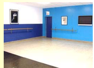
Dance Studio A