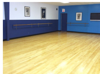
THREE DANCE STUDIOS WITH SUSPENDED HARDWOOD FLOORING