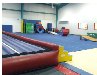
42X42' OLYMPIC SPRING GYM FLOOR !