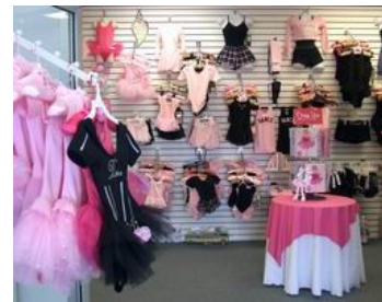
CONVENIENT DANCEWEAR BOUTIQUE